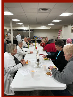
2023 Agape Supper