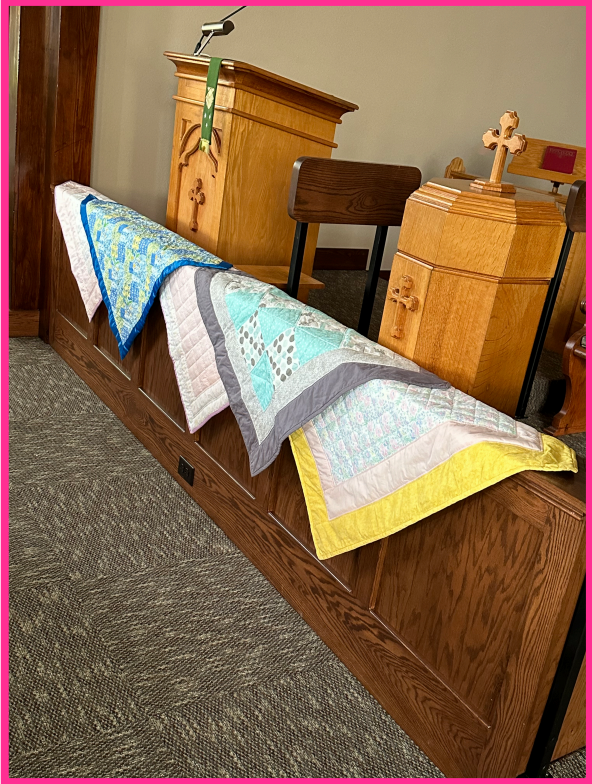
Quilts Blessed to go to the Birthing Center