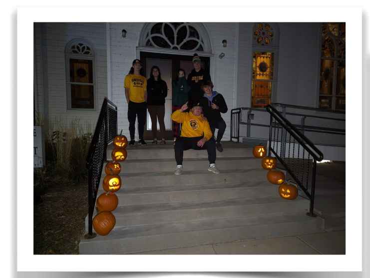
Youth Group Halloween Party